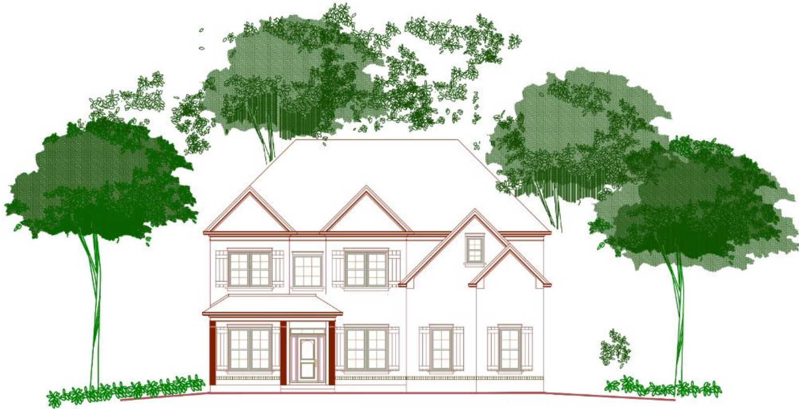
(DANIELLE)-B FRONT VIEW ELEVATION (ROCKWATER LOT 9)