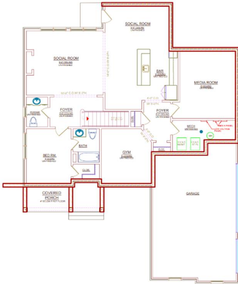
(DANIELLE) - B BASEMENT FLOOR PLAN (ROCKWATER LOT 9)